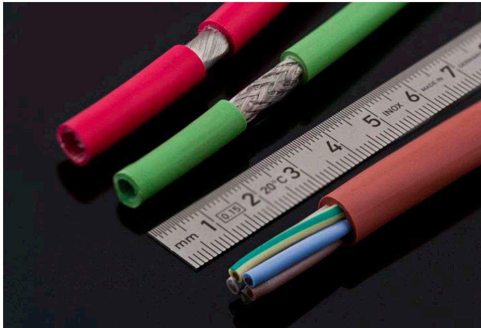
▲ Processing samples Conductors with full and partial pull-off