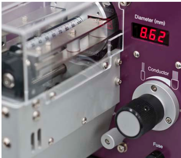
▲ Analogous controls for intuitive operation